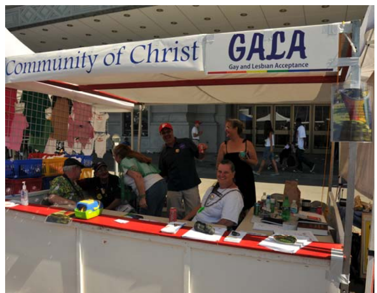
Booth at San Francisco Gay Pride