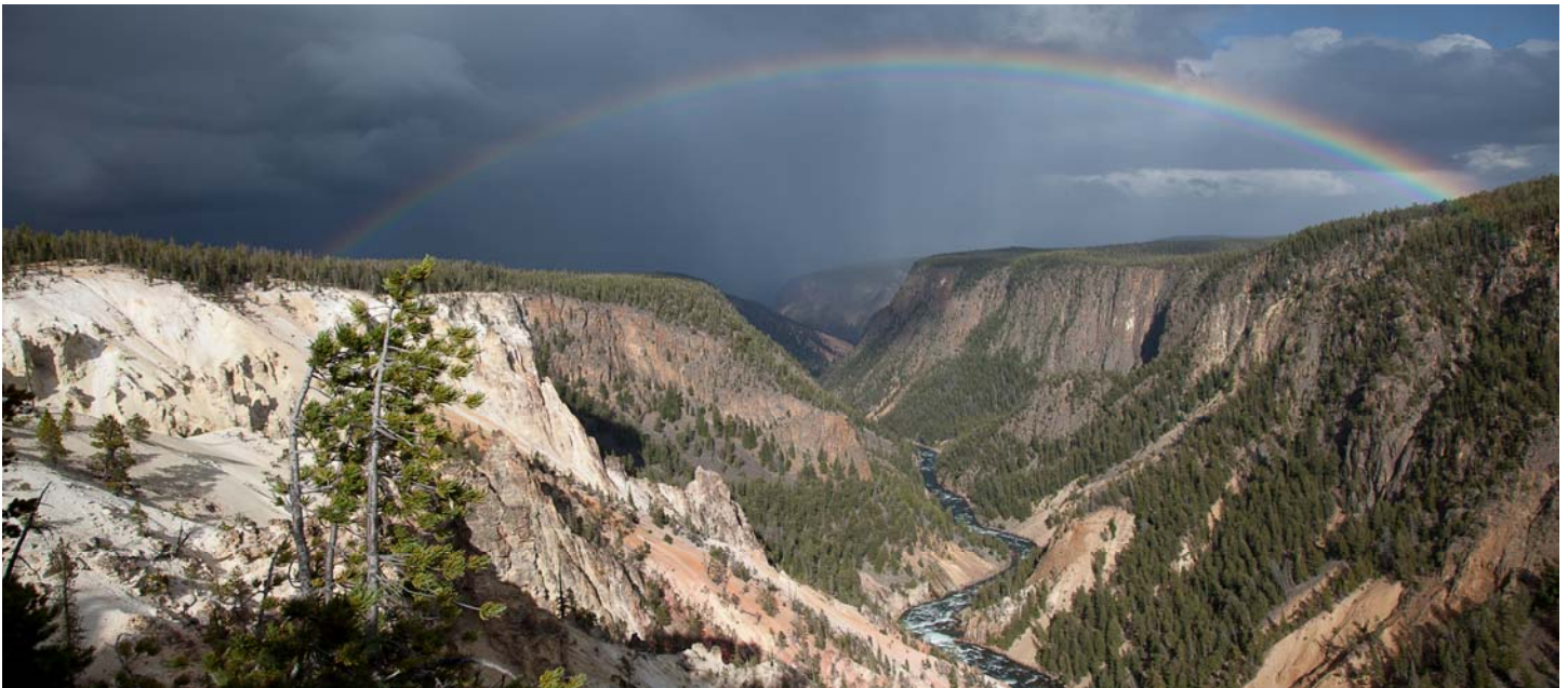
Rainbow over Yellowstone River