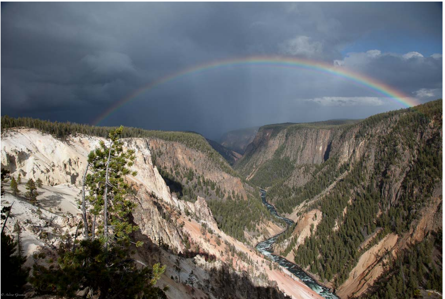
Rainbow over Yellowstone River