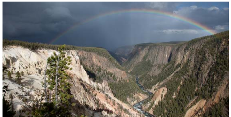
Rainbow over Yellowstone River